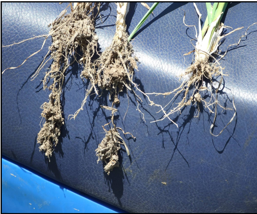
Fig.2. The two wheat plants on the left were grown with perennial grasses in a Pasture Crop treatment while the wheat plant on the right was grown in adjacent bare soil, amended with 100kg/ha DAP.

Note the little lumps adhering to the roots of the Pasture Cropped wheat (Fig.2). These clusters are formed by microbes utilising liquid carbon from the roots. Microaggregates, too small to be seen with the naked eye, are bound together by microbial glues and gums and the hyphae of mycorrhizal fungi (also using liquid carbon), to form bigger lumps called macroaggregates, generally 2-5mm in size (around 1/8 th of an inch in non-metric terms).